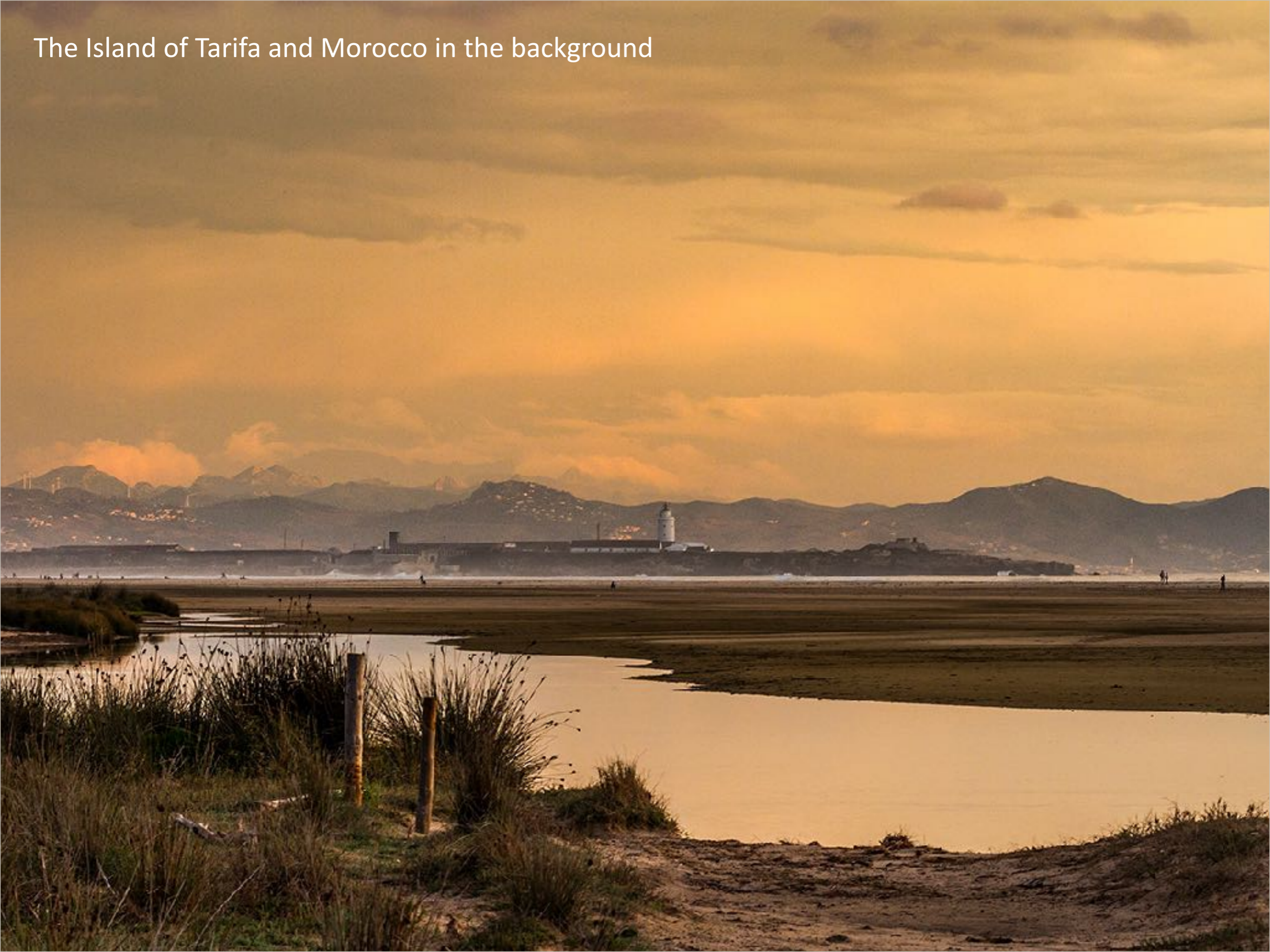
The Island of Tarifa and Morocco in the background