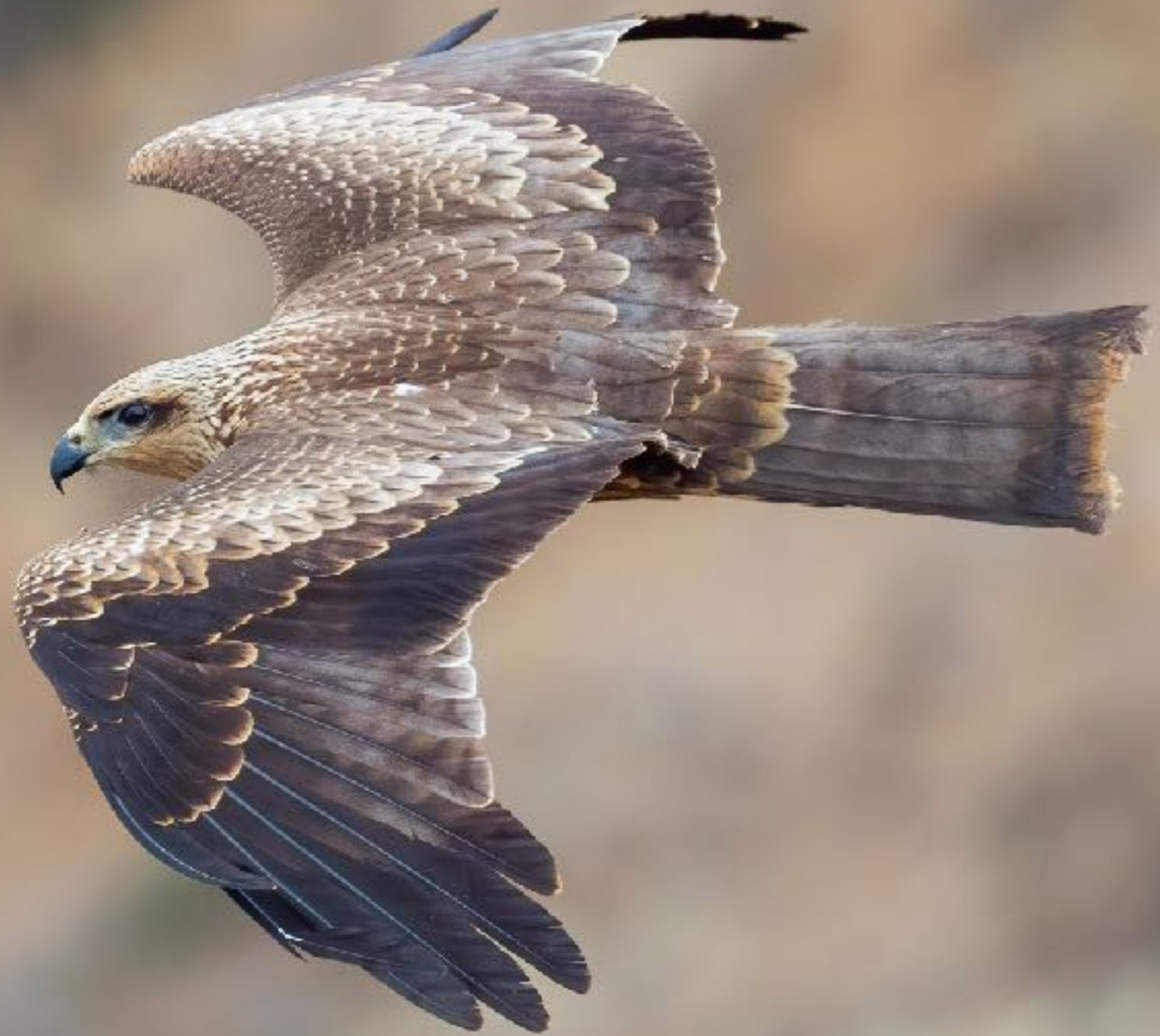
Juvenile Black Kite in migration